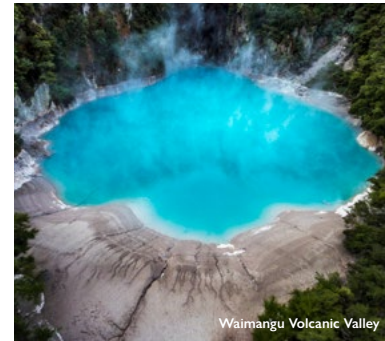
Waimangu Volcanic Valley